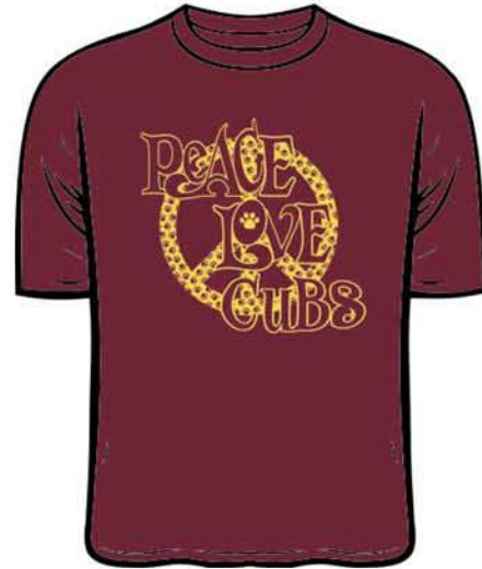
MAROON T-SHIRT GOLD IMPRINT

Please pay by CASH or Checks payable to: Christie Elementary PTA